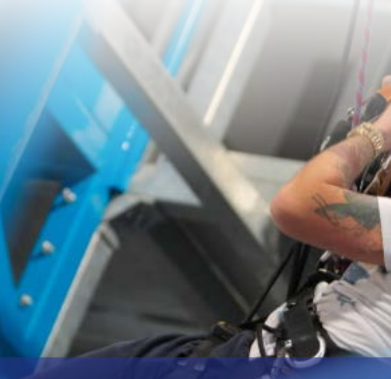
It's also important to note that the certificates required by employers can vary according to which project they're working on and the standards they follow. You can check with individual employers to find out what their specific requirements are, and ensure you understand the skills required for the role you'd like.

Wind personnel can therefore benefit from training in additional areas including rigging, banksman, rope access and first aid.